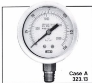
Case A 323.13